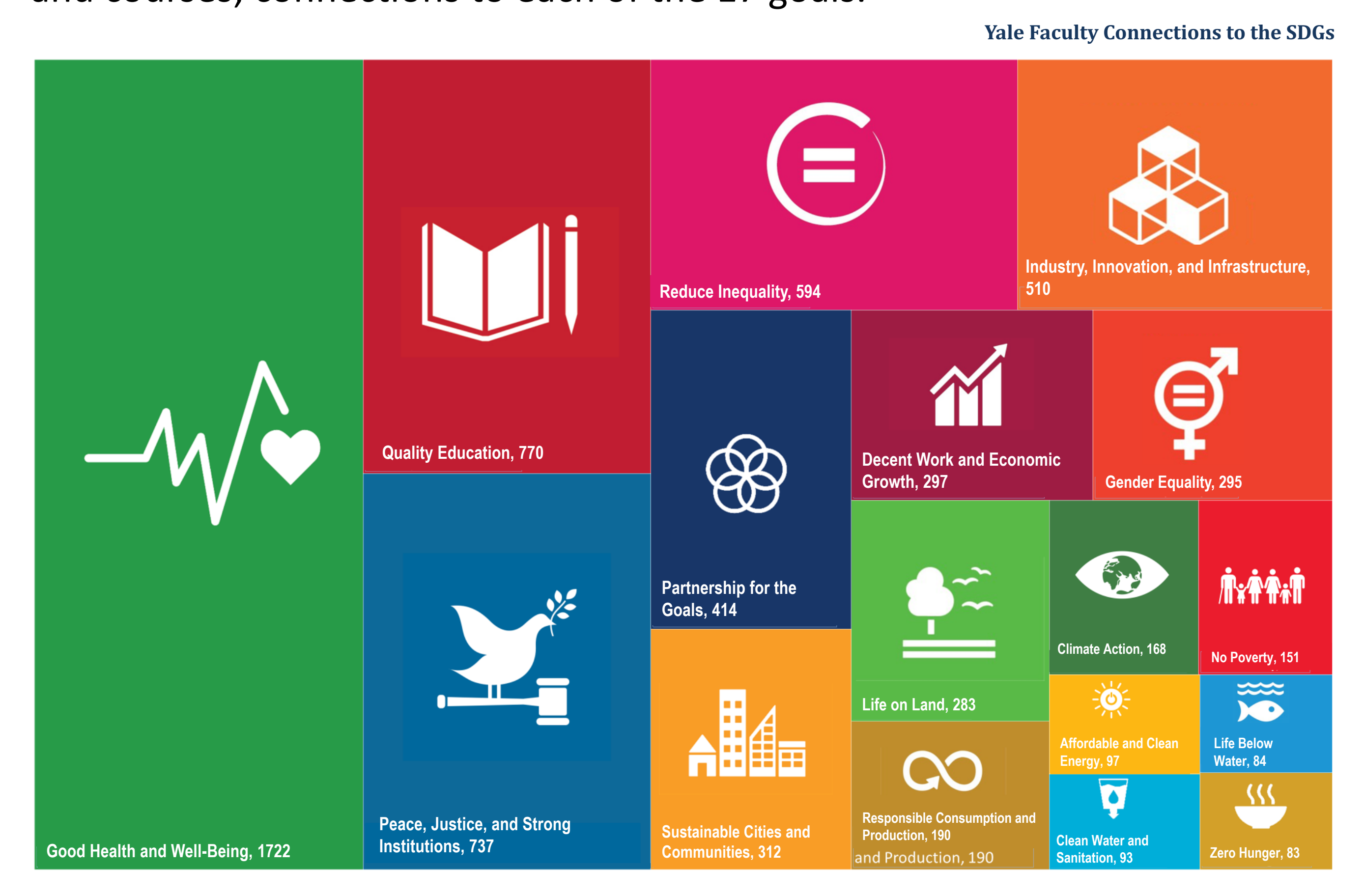
3 GOOD HEALTH AND WELL-BEING Local Faculty lives and promote well-being for all at all ages Total Faculty 1,722 Faculty of Arts and Sciences 25 out of 50 Professional Schools 9 out of 11 Medical School Departments 27 out of 27

Process: The team used an online form to collect information, including: full name, NetID, title, email; primary and secondary appointments; centers, labs, programs, or other affiliations; specialties and interests; links to website(s) and courses; connections to each of the 17 goals.