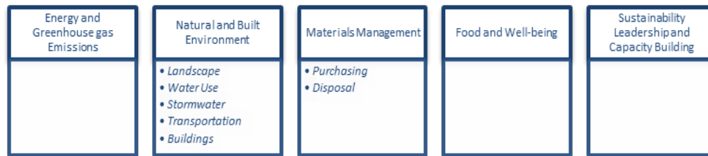
Figure 2 : Yale Sustainability Strategic Plan Categories

The Plan is available in-full online at sustainability.yale.edu . Goals that may be of particular interest to the Yale University Art Gallery include: