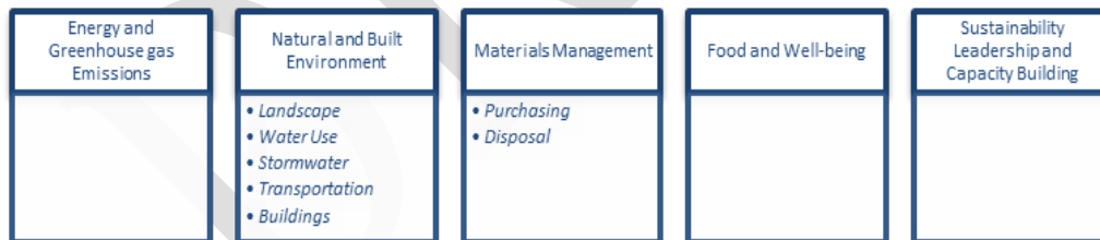
Figure 2 : Yale Sustainability Strategic Plan Categories

The Plan is available in-full online at sustainability.yale.edu .